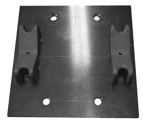
Figure 3 — The V saddle clamp assembly from the "V" side

While installing the first BelchFire 6 meter antenna, Lynn, N2HS, learned that he wasn't born with enough hands. It was awkward to hold the clamp, antenna, and the V saddle with only two of them. It was suggested that we just tap the V saddle and