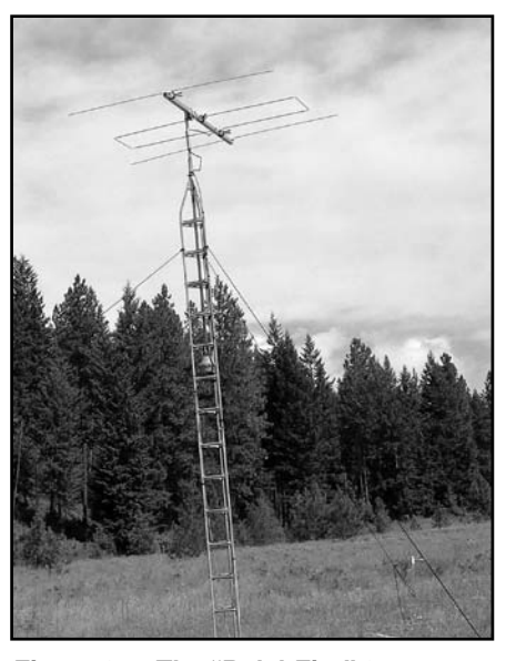
Figure 2 — The "BelchFire" 6 meter loop-fed Yagi

configurations and run antenna patterns and gain analyses.